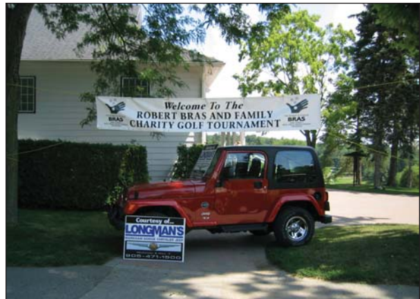
Prize for "Hole in One"