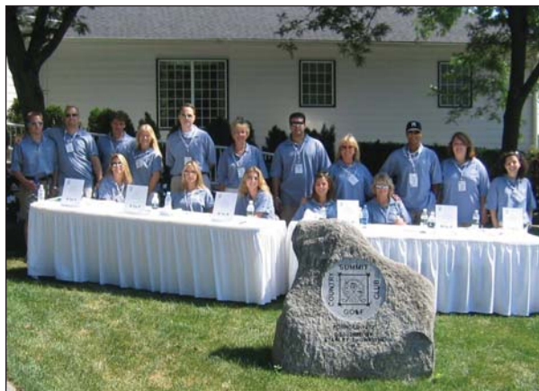
The Bras Family and Volunteers